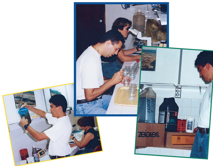
Left: Measuring out feedings of liquid diet. Right: Routine visual examination of larvae. Below: A variety of liquid diets are used at Aquamarina la Costa.

When we began testing commercial liquid diets at our larviculture facility, we followed the feeding recommendations listed on the packages of the various commercial manufacturers. Over the last three years, we have made only minor adjustments to the original feeding formats. Our current feeding program is based on water volume (particles per milliliter) from protozoa 1 through mysis 1 stage. After the larvae molt into the mysis two stage, we adjust our feeding program to a population feeding (particles per larvae) regime. We follow this scheme through to harvest. In addition to the programmed feeding schedule, visual observations of the tank condition and larval activity are used to increase or reduce the level of feed. The two critical points of an effective feeding program, whether using dry or liquid feeds, are visual monitoring and accurate population estimates.