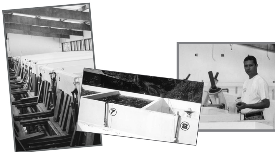
Aquamarina de la Costa Hatchery Left: Routine dry-out of one larval rearing module. Center: Cleaning an outdoor tank for mass culture of algae. Right: Metering the flow of algae into a larval tank.

There were other natural foods tested or used in larviculture, including rotifers, nematodes, and boiled egg yolks, but algae and artemia remained the foundation of feeding regimes. Maturation had been incorporated into several operations by this time, using either wild or pondraised broodstock. It was achieved through eyestalk ablation of the females – which increased the rate of maturity – and by controlling photoperiod and temperature in maturation systems. The maturation diet used consisted mainly of fresh foods supplemented with commercial pellets. A typical diet consisted of squid, marine bloodworms, oysters, clams, and a high protein pellet.